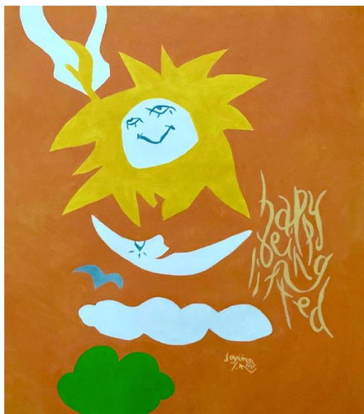
Happy Being Lifted. 2020. Acrylic on canvas

Life on earth is more of a spiritual event that lives forever, rather than a physical event that stops on earth when we die. The sun in Happy Being Lifted is being lifted by hands above, nature was made by the same spirit as humans, to me, it's so obvious, it's magical, it's the greatest event ever, nothing we do can compare to that. Not everyone agrees with that and that's ok, I'm not here to convince anyone, what we all think is right. I'm here for a reasonable discussion, not an irrational argument.