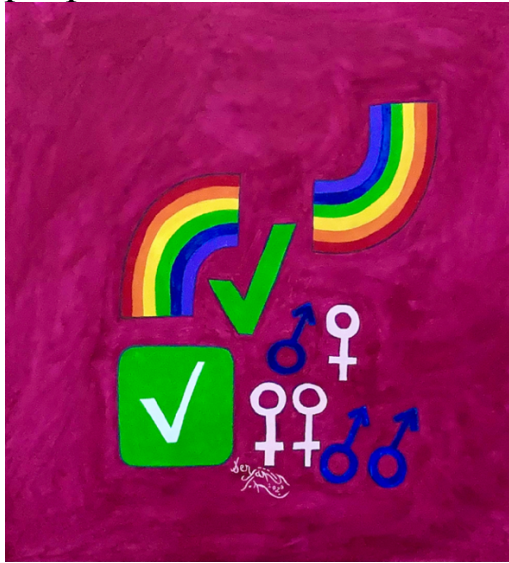
All Variations Are Good. 2020. Acrylic on canvas

constructive people that don't do crime, don't cause problems with people, the lovers. Green ticks all round.