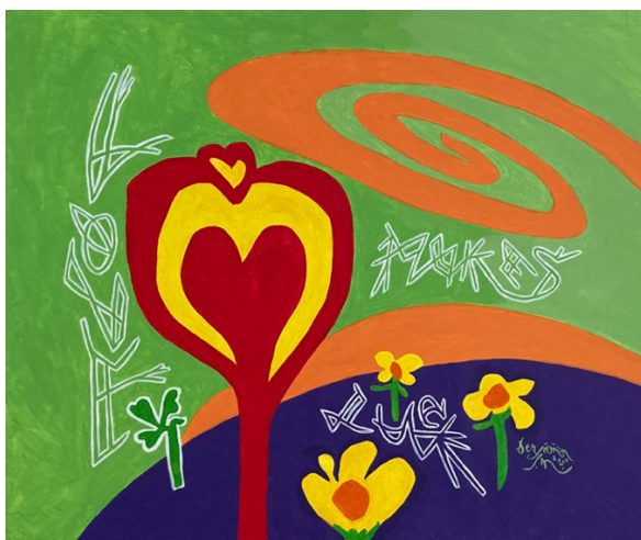
Love Makes Luck. 2020. Acrylic on canvas

Love Makes Luck is a painting about how choosing love and positivity seems to give good luck, just as choosing hate and negativity seems to give people bad luck. When I watch videos of people that have done good or bad things with their lives, they seem to be the same: They were meant to do what they do, they have no choice. People are predestined and driven one way or the other, then they spend their lives doing good or bad, and in return, they get good or bad back. It doesn't always happen straight away, sometimes it takes a long time, but eventually you get back what you put out. It's logical, nobody can escape the unchangeable structure of reality.